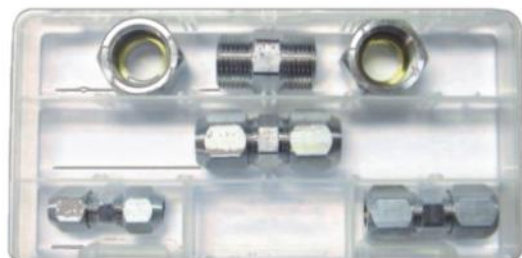
3/8" 1/2" 5/8" 3/4"