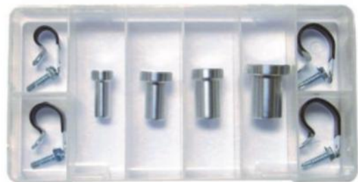
3/8" 1/2" 5/8" 3/4"