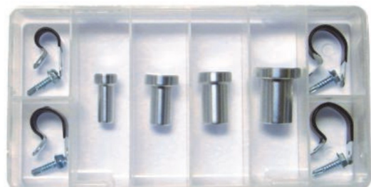
3/8" AC38B 1/2" AC12B 5/8" AC58B 3/4" AC34B