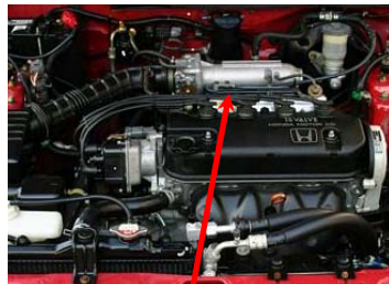
In-line Schrader® Valve Unavailable or Hard to Access