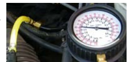
Fuel pressure tester connected to valve