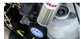
Fuel injection cleaner connected to valve