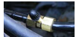
Installed In-line Schrader® valve