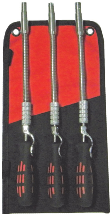
3-piece kit with storage case

Perfect for hose clamps, hex bits, and more!