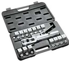
Fuel Line Assembly Tool

S.U.R.&R. Quick Connector Technology: Our exclusive universal "Quick Connector" allows for fast easy assembly without any required specialty tools to complete the repair.