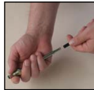
1. Attach nylon tube to fitting