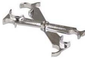
Fuel Line Disconnect Tool