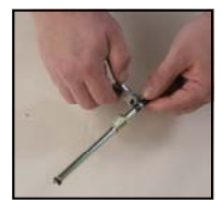
2. Crimp clamp