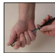
2. Push on