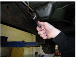
Fuel Line Repair