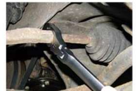
Tie Rod Repair

90° Flex Head Perfect for working in tight spots