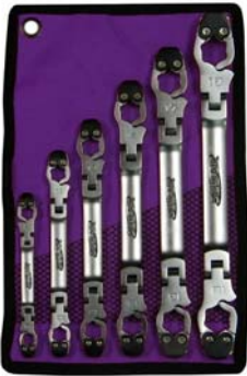
Deluxe Metric Set fits sizes from 8mm to 19mm