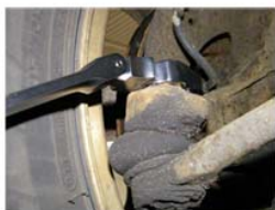
Ball Joint Repair

90° Swivel flex head provides better work area access