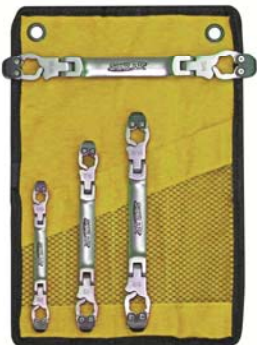
SAE Set fits sizes from 5/16" to 3/4"