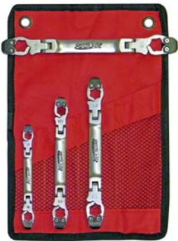
Metric Set fits sizes from 8mm to 15mm