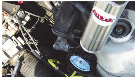
Fuel Injection Cleaner Connected to Inline Schrader Valve

® Registered trademark Schrader International.