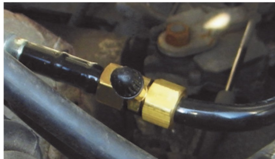
Nylon Fuel Line with Inline Schrader Valve

Install a S.U.R.&R. Inline Schrader valve.